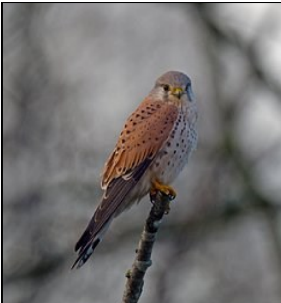
Male American Kestrel

American Kestrels occupy habitats ranging from deserts and grasslands to alpine meadows. You're most likely to see them perching on telephone wires along roadsides, in open country with short vegetation and few trees.