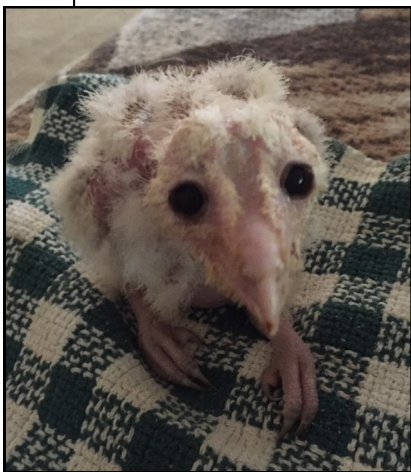
Baby Barn Owl

Sky Hunters is seeking additional monetary donations due to our baby season. With over 100 birds, caring for ill and injured owls, and ensuring a proper diet for our education birds, our food budget is in need!