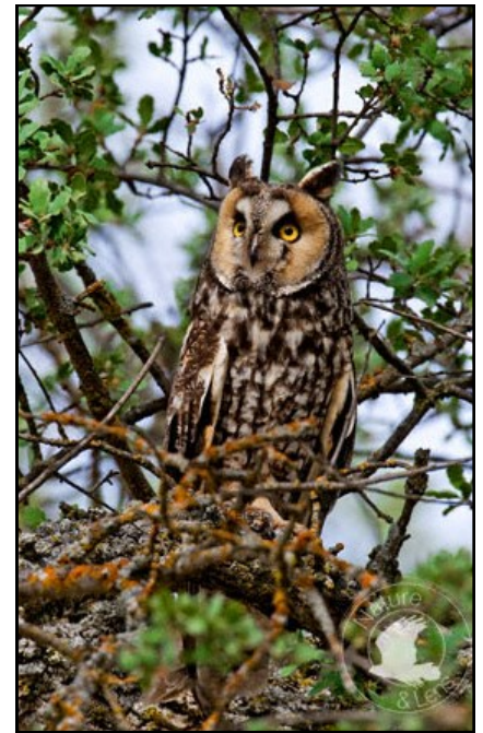
Long-eared owl ( Asio otus )

owls require a grassland or other open country for foraging, and dense tall shrubs or trees for nesting and roosting. Long-eared owls are found across most of North America, as shown above, and across Europe and Asia.