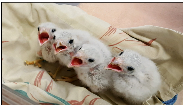
A nestful of American Kestrels, our smallest falcon, brought in for rearing this season.

Then there are always the adults who have bumped a car or a window, or eaten something