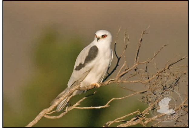
White-tailed Kite photos courtesy of Stan Keiser, Natureandlens

With its gray back and wings, white face and red eyes, the white-tailed kite is an elegant raptor. Kites are medium-sized with long, pointed wings, long white tail, and black “shoulders”. Young kites are similar in appearance to adults, but with buffy streaks on breast and head, and yellow eyes. Found over grasslands, savanna, open woodlands, marshes, desert grassland, partially cleared lands, and cultivated and grazed fields, kites regularly hover up to 80 feet off the ground and then drop straight down on to prey items. Their ability to hold a stationary position in midair without flapping is done by facing into the wind, and is called “kiting”. White-tailed kites prey on small mammals, primarily voles, as well as some birds, lizards, and insects. One study showed that more than 95% of prey were small mammals.