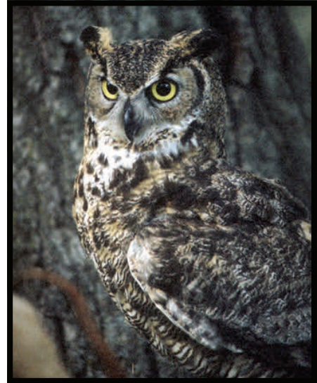
Great horned owl ( Bubo virginianus )

Great horned owls are the only owl in southern California that has a “hooting” vocalization—a much more dignified call than our common barn owl that screeches like a lady who has just seen a rat!