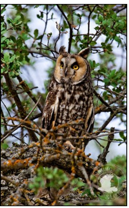
Long-eared owl (Asio otus)

Males give a series of 10 to more than 200 "whoo" notes evenly spaced about 2–4 seconds apart. This deep and forceful sound, akin to the sound made by blowing across the lip of a large bottle, can be heard more than half a mile away.