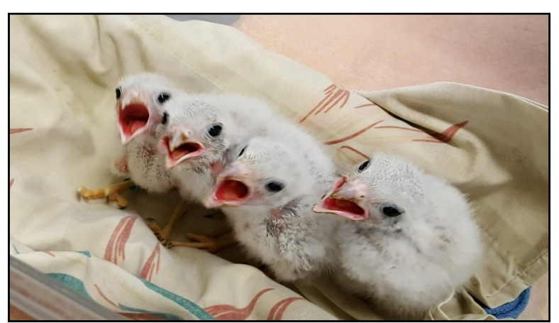
A nestful of American Kestrels, our smallest falcon, brought in for rearing this season.

Then there are always the adults who have bumped a car or a window, or eaten something