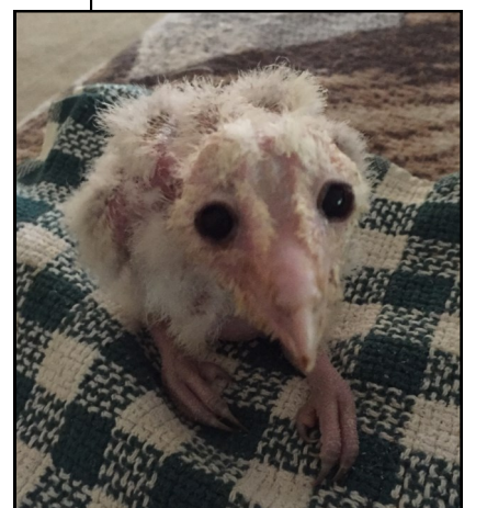
Baby Barn Owl

Sky Hunters is seeking additional monetary donations due to our baby season. With over 100 birds, caring for ill and injured owls, and ensuring a proper diet for our education birds, our food budget is in need!