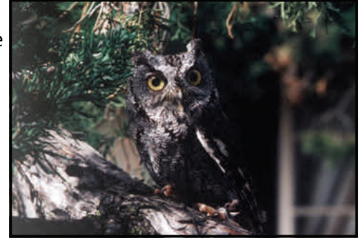
Western Screech Owl ( Megascops kennicottii )

Let's talk about our little western screech owl, a species that we don't get in for rehabilitation very often. Screech owls are small, like our little burrowing owl, standing only about 7.5 to 9.5 inches tall with a 21.5 to 24 inch wingspan. They are found in a diversity of habitats, but primarily in riparian habitats and deciduous trees, but also in urban and suburban parks and residential areas. Locally, woody areas like Torrey Pines State Park and other stream and oak areas are their homes. The screech owl, like some other owls is a cavity nester. They don't go out at night gathering sticks to build a nest but rather look for a broken branch, the hollow in a tree, or a large enough wood pecker hole.