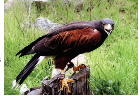
Harris's Hawk ( Parabuteo unicinctus )

Harris's hawks are a medium to large-sized hawk, with a beautiful overall dark color, rust-red shoulders and leggings, a white rump and tail tip, and yellow bare skin on the face and legs. This raptor species is found in variety of habitats, from dry shrublands in lowlands and mountains, tropical deciduous forests, and wet grasslands. With city sprawl into native habitats, Harris's hawks can be seen in the suburbs of desert cities!